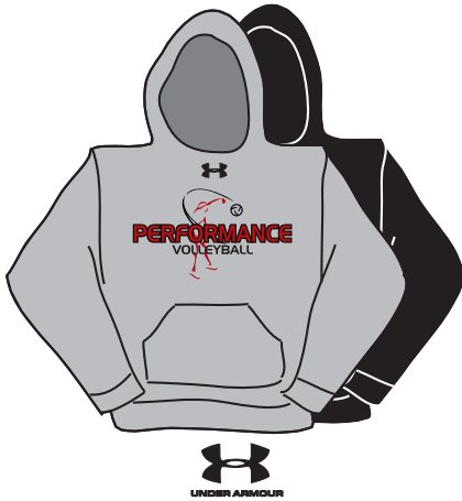
HOODED SWEATSHIRT COLOR: GREY, BLACK $43.00