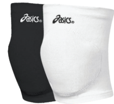
asics KNEE PAD COLOR: WHITE, BLACK $22.00

ORDERS WILL NOT BE PROCESSED UNTIL AFTER DEADLINE EXPIRES