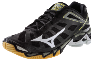
MIZUNO WAVE LIGHTNING RX3 SHOES COLOR: BLACK/WHITE SIZES: 6-12, 13, 14 $90.00