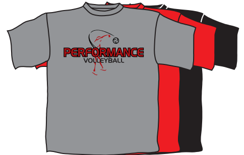
PERFORMANCE TEE COLOR: GREY, RED, BLACK SIZES: SM - XXL $15.00