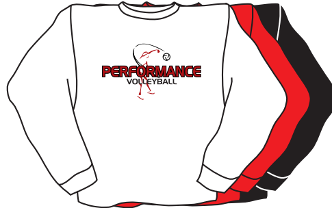
LONG SLEEVE PERFORMANCE TEE COLOR: WHITE, RED, BLACK SIZES: SM - XXL $18.00