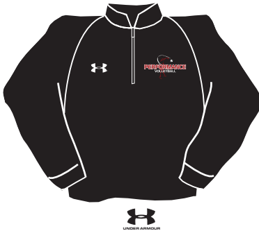
1/4 ZIP PULLOVER COLOR: BLACK SIZES: S - XXL $43.00