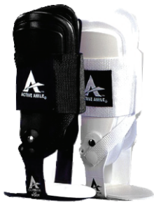
ANKLE BRACE COLOR: WHITE, BLACK SIZES: SM - L $44.00