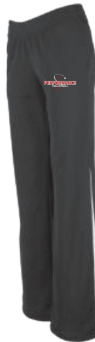
WARM-UP PANT COLOR: BLACK/WHITE LADIES SIZES: XS - XXL $42.00